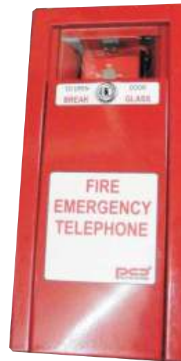
Floor Module zone 16